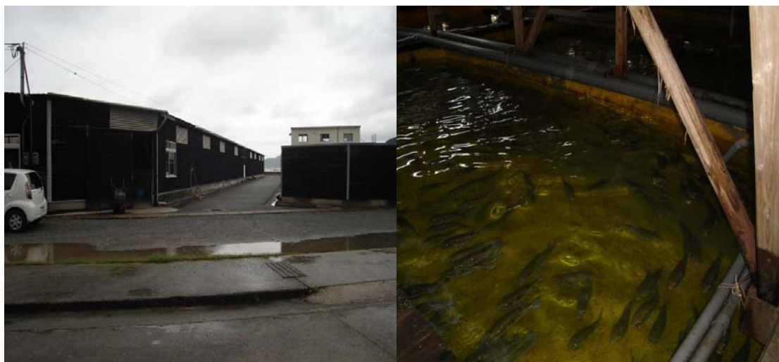
Figure 3 . Aquaculture farm for tiger puffer with land based culture tank with running seawater (Ando construction company). Left, farm overview; right, inside (culture tank).

Treatment of teeth is one of the characteristics of tiger puffer aquaculture. The fish is known to have territorial disputes, biting each other at high stocking density, and therefore its teeth are cut or removed to prevent serious injury by most farms. The method for teeth treatment depends on the farms and the lower teeth are cut 3 times during production by many farms. One of the most serious problems in the net cage aquaculture of tiger puffer is extremely low productivity due to high mortality from outbreaks of parasitic diseases (Ogawa and Inouye 1997). Survival during the production period is estimated to be less than 50%. Studies have been conducted to develop effective treatments for the disease (Hirazawa et al. 2000, 2001) and there is a commercial agent for oral administration. However, it is still expensive to use in aquaculture and has not been widely adopted. Recently some farmers started to produce the fish in land based culture tanks with running seawater (Fig. 3) and some have been trying closed recirculating aquaculture to improve productivity.