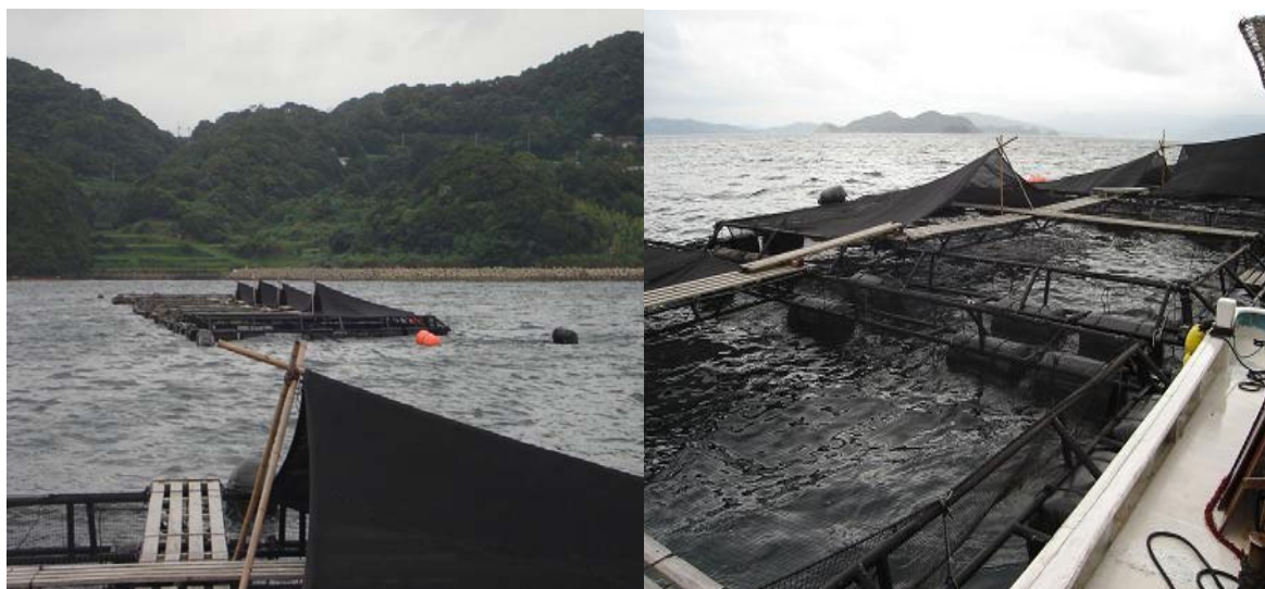
Figure 1. Floating net cage aquaculture of tiger puffer (Tajima suisan). Left, overview; right, cages

(Kumamoto Prefectural Fisheries Research Center 2001). Locally available raw fish, sardines and sand lance, are still used by many farms. Stocking density is adjusted to less than 0.4 \text{ kg/m}^3 net cage for fish weighing up to 40 g, 1.3 \text{ to } 1.5 \text{ kg/m}^3 for fish weighing 200 to 450 g, and 2.0 \text{ to } 3.0 \text{ kg/m}^3 for fish weighing 700 g to 1.2 kg. In Kumamoto, southern Japan, five-gram fish grow to 40 g from June to early August, grow to 200 g by the end of October, to 450 g by the following May, and to 700 g by the following October (Fig. 2). The growth of the fish slows considerably from January to March because of lower feeding activity due to low water temperature of less than 16^\circ\text{C} even at southern Japan. Eighteen to 20 months are required to produce suitable market size fish of more than 800 g.